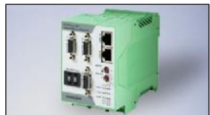
PRS – PROFIBUS DP Redundancy Switch

PRS also allows the realization of very complex redundancy systems, i.e. in connection with PROFIBUS OPC servers or overlying Ethernet based cell networks.