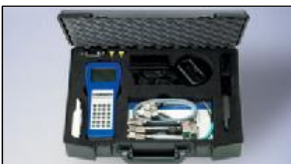
NetTEST II service case