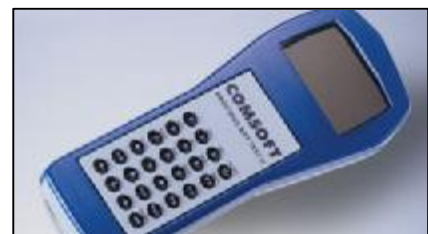
NetTEST II hand-held